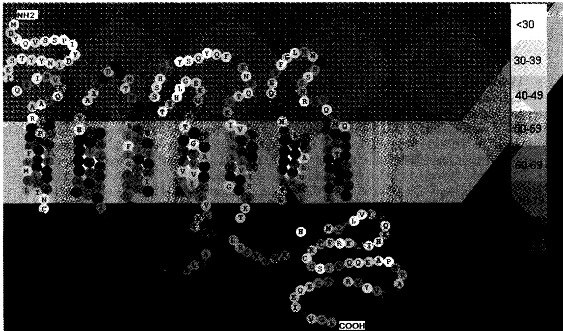
Fig 3: Residue homology among chemokine receptors. The percentage of residue conservation is indicated in shades of gray. Darker represents higher degree of conservation (scale on the right). CCR5 amino acid sequence is used as reference.

regions of chemokine receptors are the major determinants of ligand-binding selectivity. Conversely, the binding and activation sites in the receptor may be determined by other motifs common to all chemokine receptors. The traditional approach to identifying the binding and activation sites involves applying Ala scanning mutagenesis. Interestingly, Ala substitution of residues in the N-terminus of CXCR1 did not affect binding to IL-8, however the N-terminus synthetic peptide of CXCR1 bound IL-8 with low affinity (Leong et al , 1994). This suggests that the N-terminus of the receptor adopts a configuration that allows interaction of IL-8 with the polypeptide backbone rather than with specific side chains. This is not unprecedented, as most of the binding interface of CD4 to HIV-1 gp120 occurs via main-chain atoms (Kwong et al , 1998). Further Ala substitutions in the extracellular loops in CXCR1 have shown that Arg 200 and Arg 203 in the second extracellular loop and Asp 265 in the third extracellular loops are major determinants for binding to IL-8. Therefore, it is likely that the ligand-binding pockets of chemokine receptors